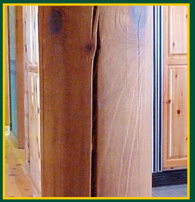
CHECKS IN LOG

Logs and Timbers are Eastern White Pine and harvested in Wisconsin. All Full Log Products are air-dried and will naturally develop checks or cracks as they dry. This is an unavoidable natural process. Each individual log will contain the heartwood of the tree. A check will never pass through the heartwood, which maintains the structural integrity of the log.