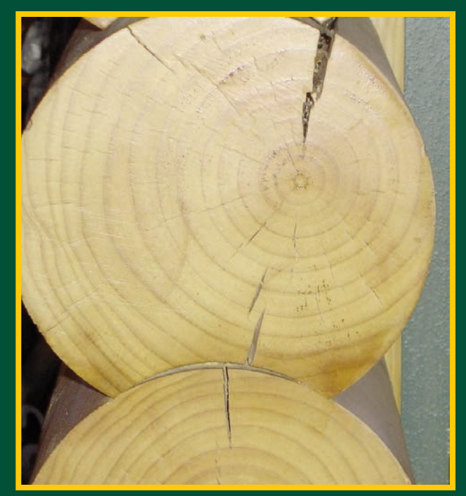
HEARTWOOD AND CHECKS

Full Log Products are raw log products and may require cleaning and/or sanding before finishing. We recommend using a breathable stain and avoid using any sealers like varnish or polyurethane.